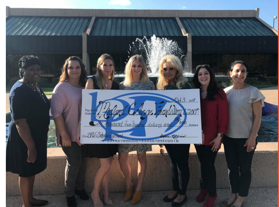
Presenting the Midland College Foundation a $6,200 check from our BPW Bunco fundraiser in the Spring.

Programs Scholarship Membership Community Projects Finance By-Laws Leadership PR/Hospitality Bunco Fundraising